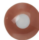
Clear / Open Pupil