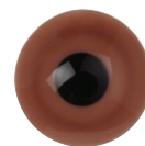
Black / Closed Pupil